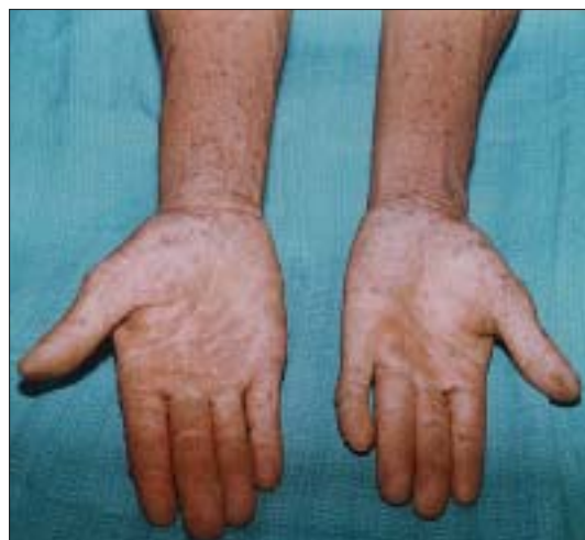
Figure 1B: Same patient with arsenical hyperkeratosis affecting the palm and forearm

There are several non-dermatological conditions which are not highlighted as clinical criteria for diagnosis of arsenicosis but are frequent accompaniment of arsenicosis. They include chronic cough, respiratory distress, hepatomegaly, non-cirrhotic portal fibrosis, cirrhosis, ascites, peripheral neuropathy, peripheral vascular disease, hematuria, non-pitting edema, etc. [Table 2]. [1] It becomes essential to look for these systemic manifestations since they can at times be of diagnostic importance. The fact that all cases of arsenicosis do not manifest cutaneous features at the very outset is a reason why evaluation of systemic condition should be done to pick up the suspected cases.