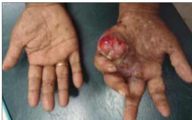
Figure 3: Arsenical hyperkeratosis giving rise to squamous cell carcinoma on the left hand

disease associated with gangrene is treated with drugs like pentoxifyllin or calcium channel blockers with limited effect. Most of these patients need surgical amputation. [15]