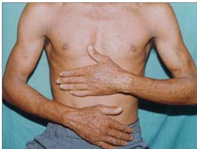
Figure 1A: Rain-drop pigmentation on the trunk, along with arsenical hyperkeratosis affecting the dorsa of hands, fingers, and forearm